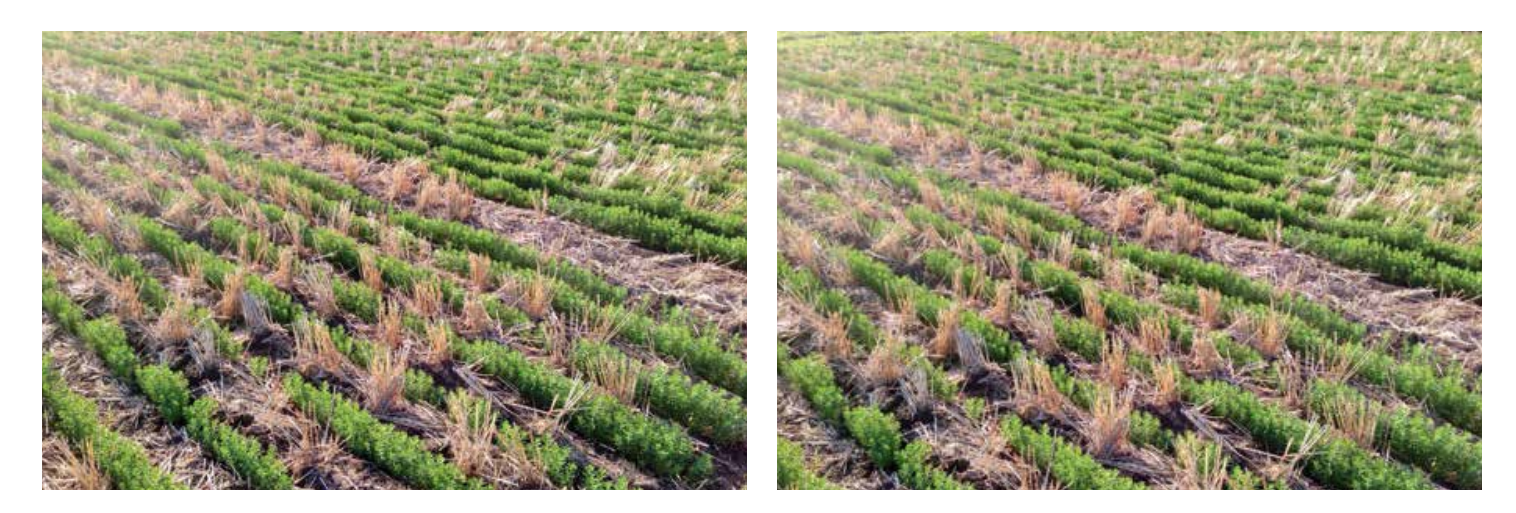
Early-seeded (May 3, left) and late-seeded (May 30, right) flax on June 30, 2016 at Indian Head.

nitrogen rates (0, 50, 100, and 150 kg N kg/ha) combined with four phosphorus rates (0, 20, 40, and 60 kg P<sup>2</sup>O<sup>5</sup> per ha), all side-banded. Rates used in this trial are significantly higher than what are typically used in production and flax fertility research, in order to determine optimal fertility rates for producing consistently high-yielding flax.